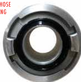
POK8179 UNDERSIDE VIEW 65MM HOSE COUPLING