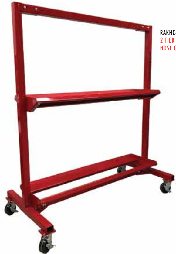
RAKHC-64-2T 2 TIER MOBILE HOSE CART