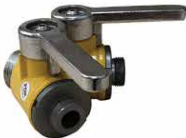
WYE DIVIDING BREACH