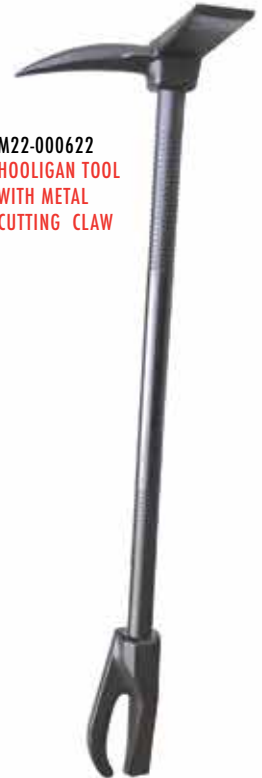
M22-000622 HOOLIGAN TOOL WITH METAL CUTTING CLAW