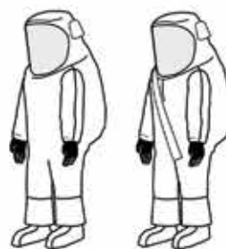
VAPOUR TOTAL ENCAPSULATING