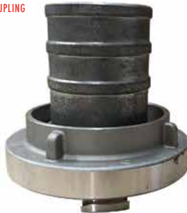
POK8179 65MM HOSE COUPLING