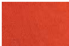
NOMEX® IIIA ORANGE