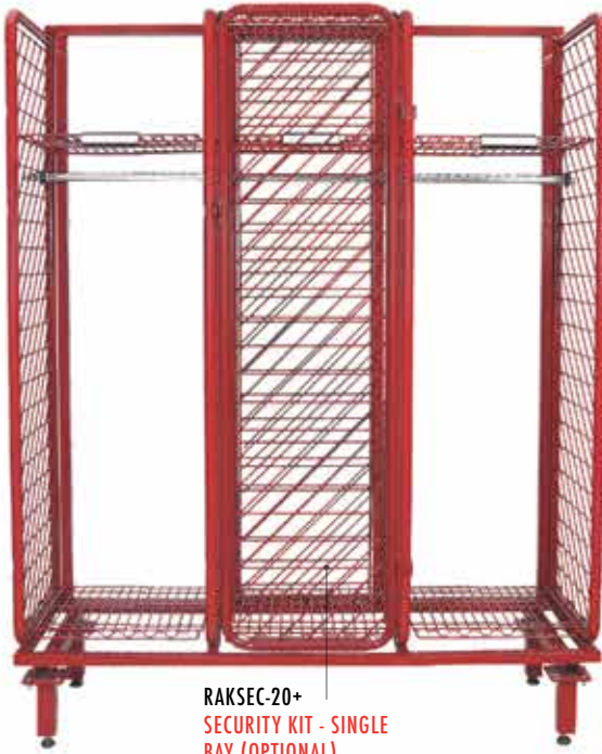
RAKSEC-20+ SECURITY KIT - SINGLE BAY (OPTIONAL)