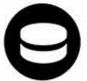
DUAL LAYER CONSTRUCTION