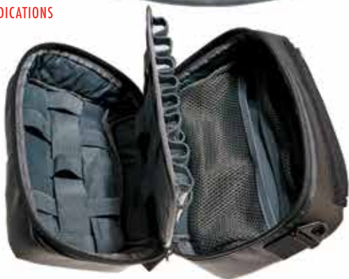
M5101J MEDKIT MEDICATIONS MODULE