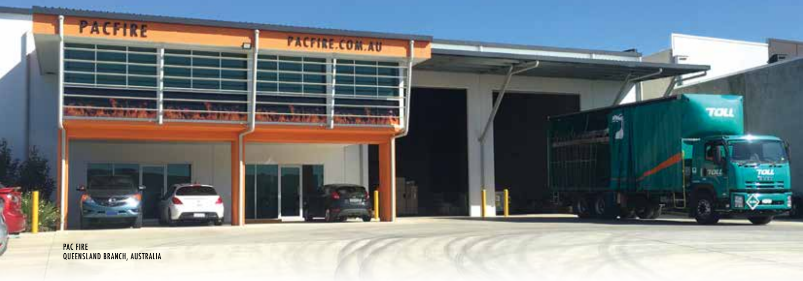
PAC FIRE QUEENSLAND BRANCH, AUSTRALIA