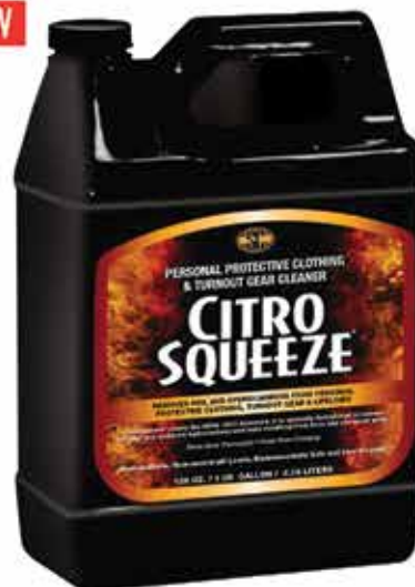
FS-C-001-4 TECHNICAL TEXTILE DETERGENT