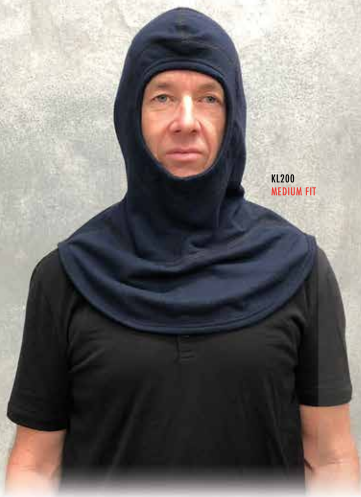
KL200 MEDIUM FIT