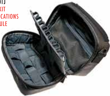
M5101J MEDKIT MEDICATIONS MODULE