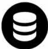
MULTI LAYER CONSTRUCTION