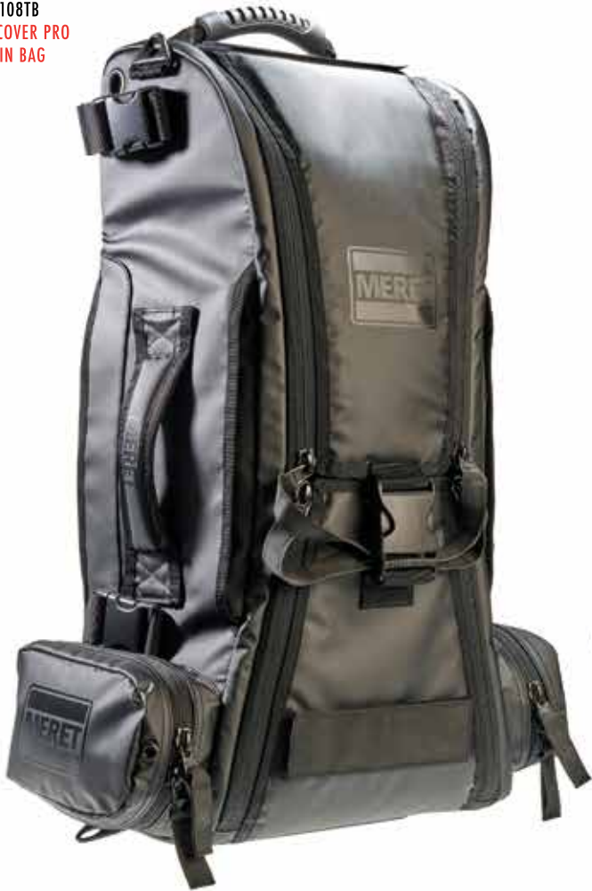
M5108TB RECOVER PRO MAIN BAG