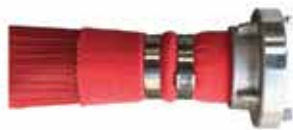
BAND-IT CLAMPING (MBANDING)