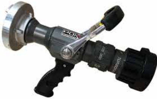
TURBOKADOR 500 HOSE LINE NOZZLE