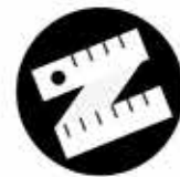
THREE SIZES SMALL, MEDIUM & LARGE