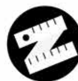
THREE SIZES SMALL, MEDIUM & LARGE