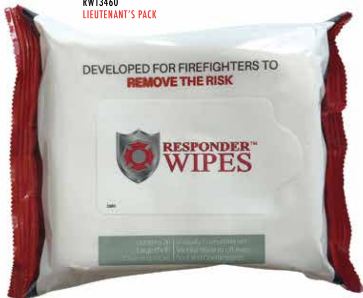
RW13460 LIEUTENANT'S PACK