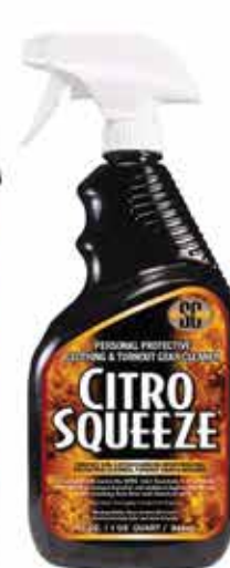
FS-C-032-6 PRE-TREATMENT SPRAY