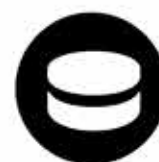
DUAL LAYER CONSTRUCTION