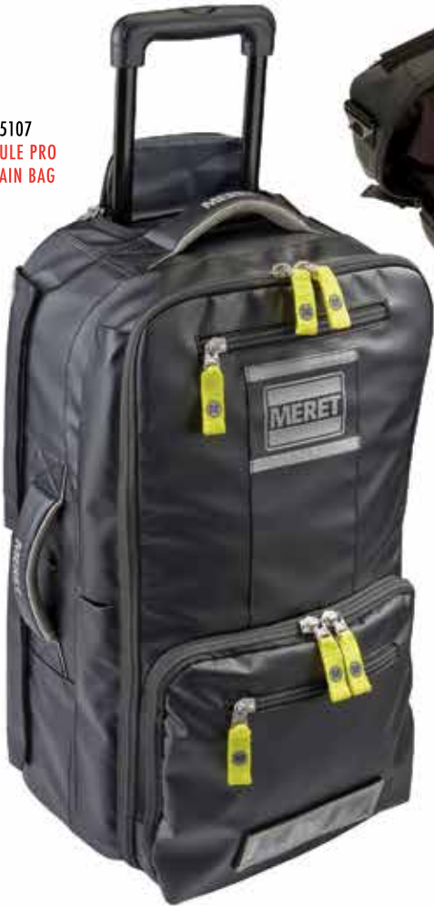
M5107 MULE PRO MAIN BAG