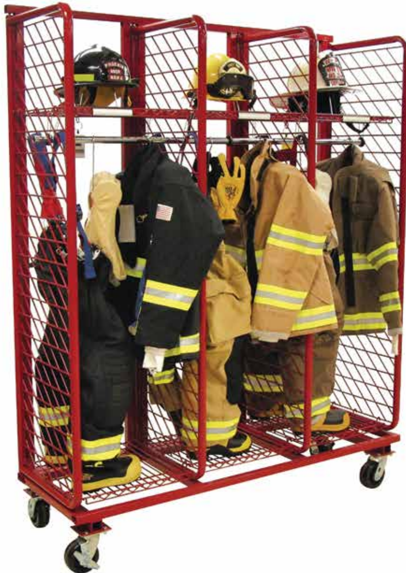
RAKRMSS-3/20+ SINGLE SIDED - 3 BAYS