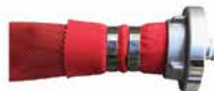
BAND-IT CLAMPING (MBANDING)