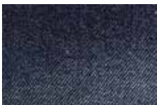
NOMEX® IIIA NAVY