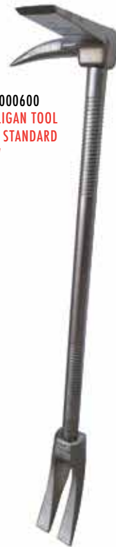
M22-000600 HOOLIGAN TOOL WITH STANDARD CLAW