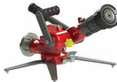
PORTABLE POCKET MONITOR