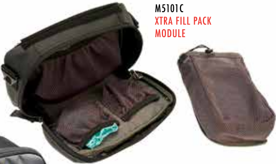
M5101C XTRA FILL PACK MODULE