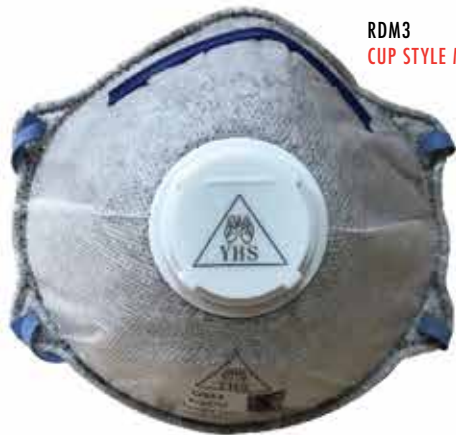
RDM3 CUP STYLE MASK