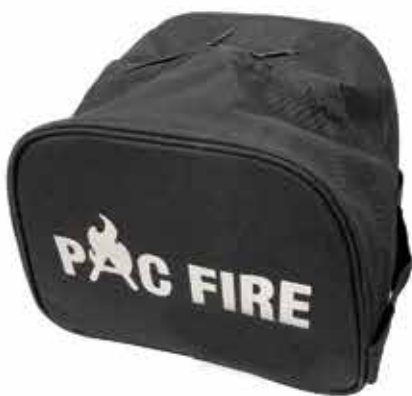
BAG5814 SMALL BAG