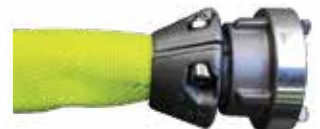
BAND-IT CLAMPING (MBANDING)