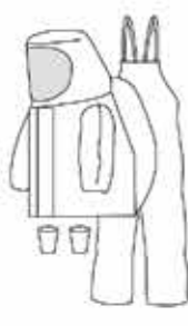
SPLASH TWO PIECE ENSEMBLE