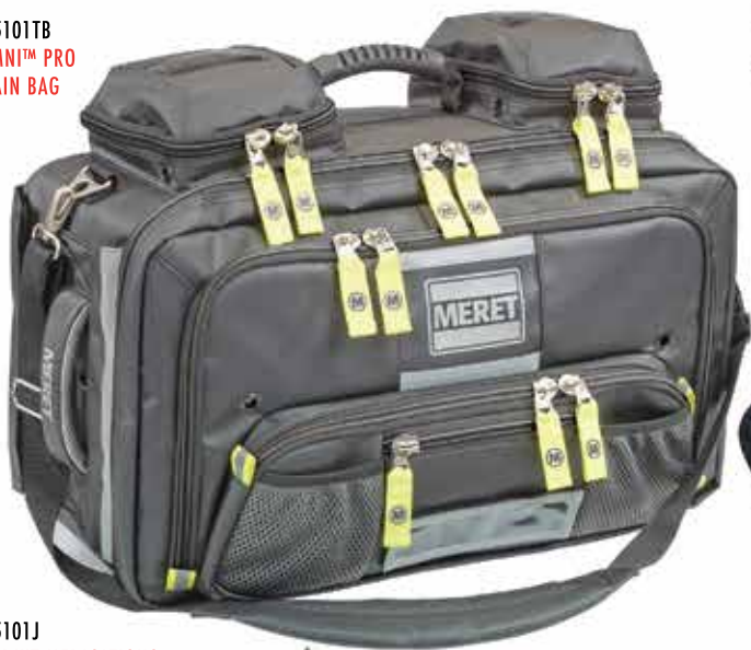
M5101J MEDKIT MEDICATIONS MODULE