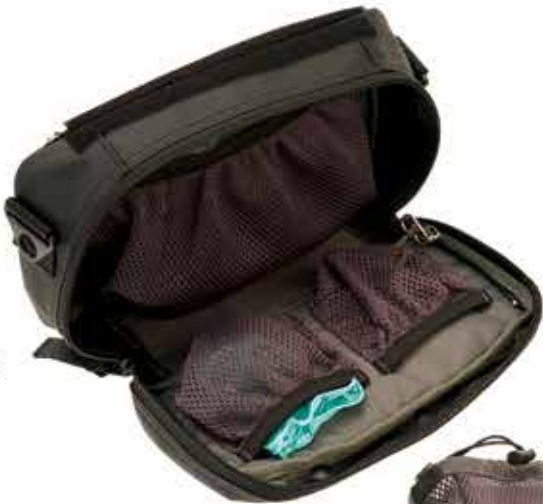
M5101C INSIDE VIEW