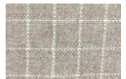
PBI® MATRIX GOLD

PBI® Gold Matrix is a blend of 40% heat and flame resistance PBI® fiber and 60% high strength aramid fiber. This blend results in next level thermal protection and durability. It doesn't shrink, become brittle or break open under exposure to extreme heat and flame.