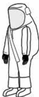
VAPOUR TOTAL ENCAPSULATING