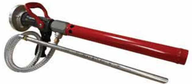
LOW EXPANSION SELF EDUCING FOAM BRANCHPIPE