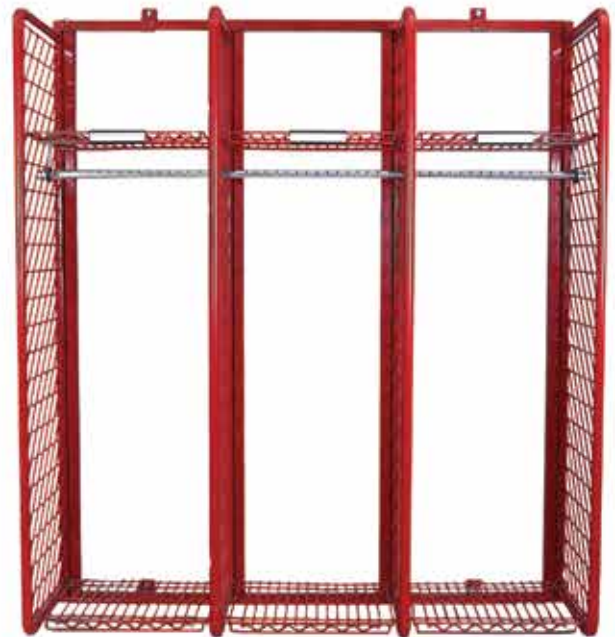
RAKRRWM-3/20+ WALL MOUNTED - 3 BAYS