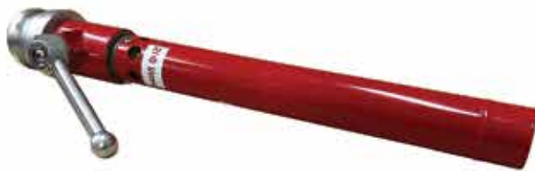
LOW EXPANSION FOAM BRANCHPIPE